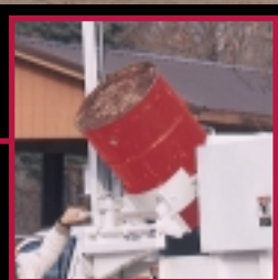
Add a barrel dumper or a cart dumper to either side.