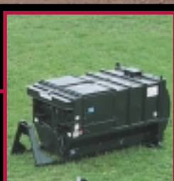
Hook up and go, works with any hook lift.