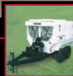
Pull it or park it, the trailer mount is always ready to work for you.